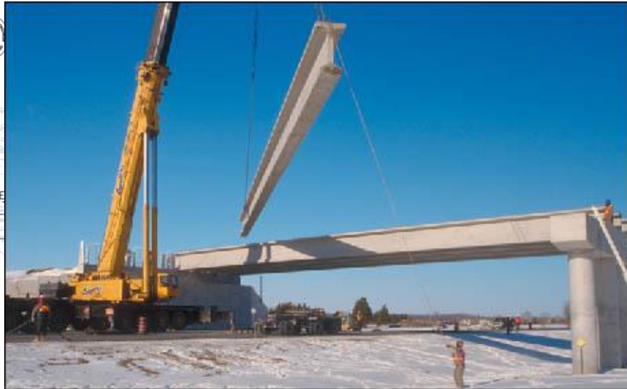
Figure 1: Plan Location for Precast Concrete Girder Erection and Typical Crane Erection